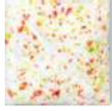
SG303 Citrus Snow Gem