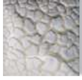
SW403 White Mudcrack