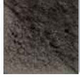
SW406 Dark Magma