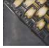
SW304 Copper Wash