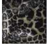
SW404 Black Mudcrack