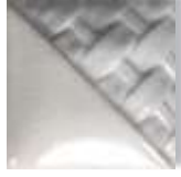
SW149 Crackle White