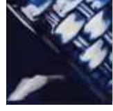
SW305 Cobalt Wash