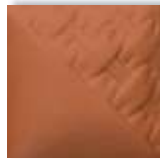
EG007 Terracotta Engobe