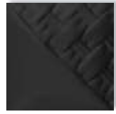
EG005 Black Engobe