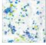
SG305 Spearmint Snow Gem