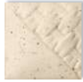
EG002 Speckled Buff Engobe