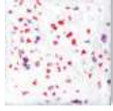
SG304 Berry Snow Gem