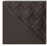
EG004 Dark Brown Engobe