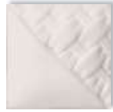
EG001 White Engobe

Engobes are a hybrid of slip, glaze and underglaze, used to coat your clay body to your preferred finish/color and are often used for a variety of decorative techniques, such as sgraffito and majolica. They can be applied to wet clay, greenware or bisque and fire from cones 5-10.